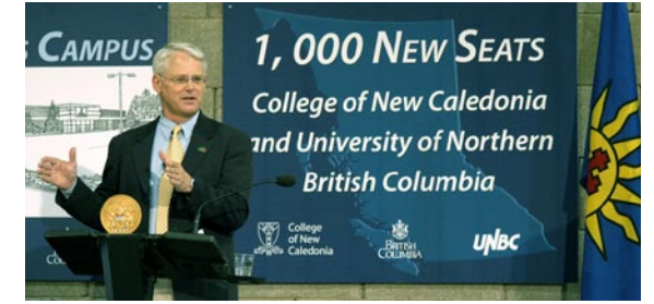
The Teaching & Learning Centre will help accommodate additional student seats, which were announced in June, 2004.