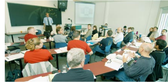
Classes for UNBC's Master of Business Administration program will take place in the new Teaching & Learning Centre.