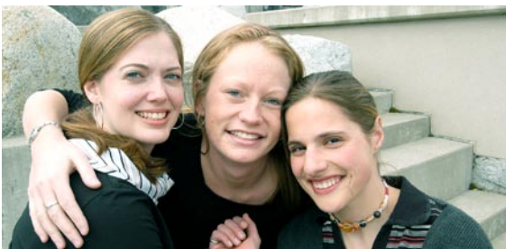
These students were part of the first-ever class to complete UNBC's Bachelor of Education program in 2004.

In addition to the new building, the Government is also funding some renovations to the Geoffrey R. Weller Library that will provide more space for the growing library collection and enhance the Library's links – via the Internet – to research sources around the world. Many of the classrooms, research space, and offices currently located on