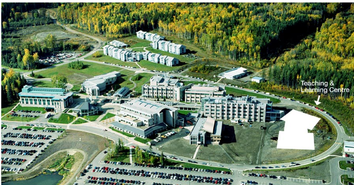
An aerial view of UNBC's Prince George campus.

“This expansion will allow UNBC to continue to grow and its students to be successful.”